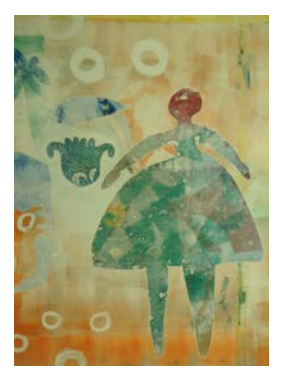
Monotype by, Melanie Yazzie

For best results, print with Akua Inks. Other brands of water- or oil-based inks can be used on this surface. However, Akua Inks offer extended working time to create the image.