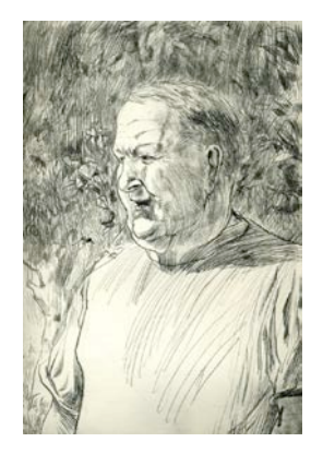
Drypoint by, Jeffrey K. Fisher

Draw into plate using a needle scribe, roulette, etc. This will create incised lines that will hold ink.