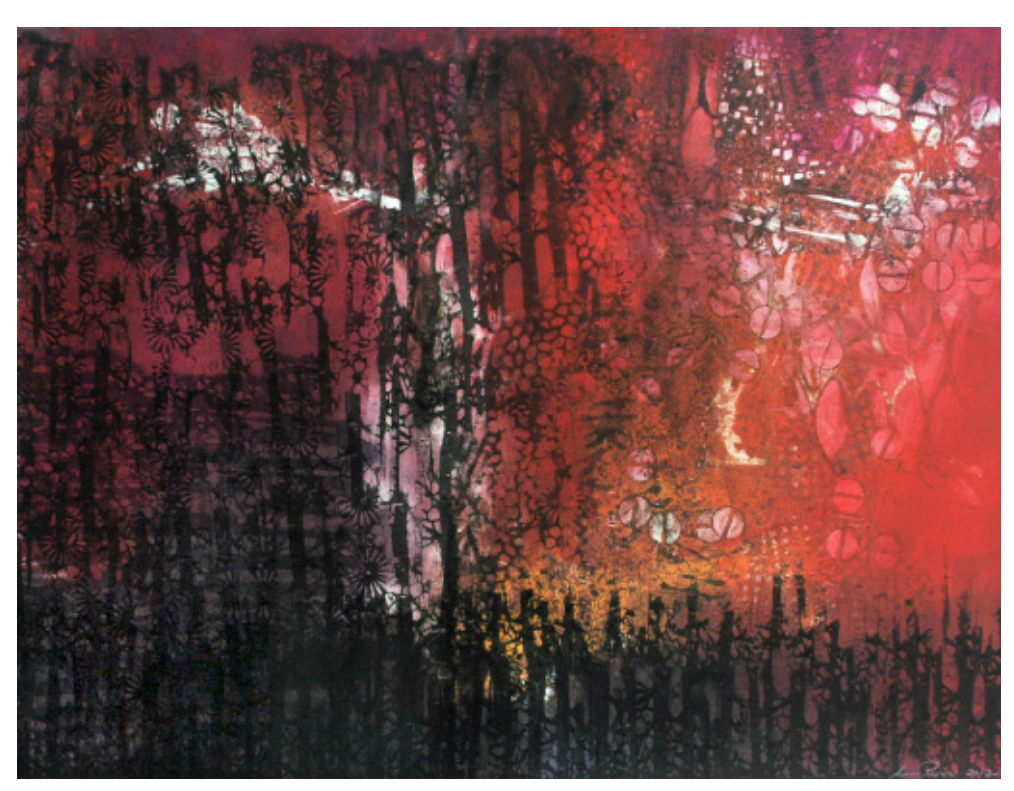
User Guide | June 2013