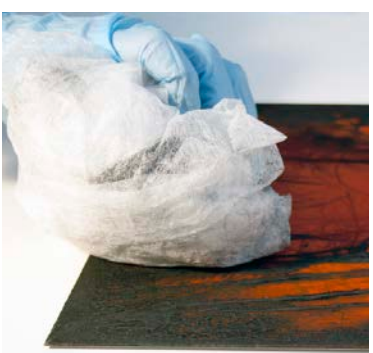
Akua Wiping Fabric

Akua Wiping Fabric is ideal for wiping excess ink from the surface of an intaglio plate. It is made from polyester which is sturdy, long-lasting and lint free. Akua Ink will never dry and harden on this fabric so the same piece can be reused over and over again. It is less absorbent, smoother and